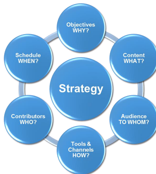
Figure 2.1: Elements of SERENDI-PV dissemination & communication strategy

The main elements of SERENDI-PV dissemination and communication strategy are summarised in the following figure and are later described in the document. The Plan for Dissemination and Communication defines the optimal and relevant interactions among these elements.